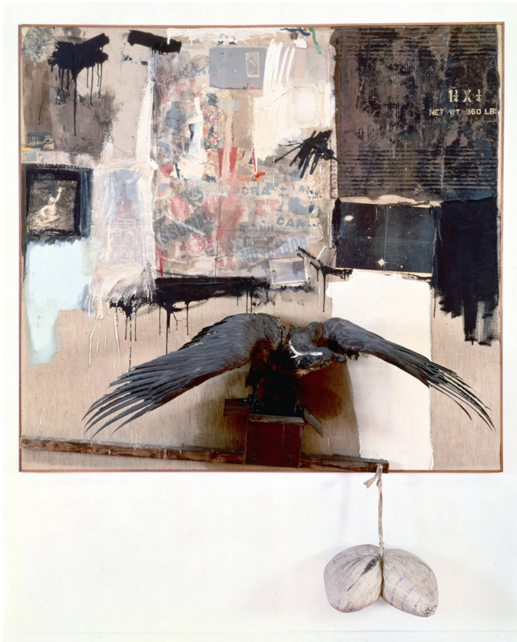
Robert Rauschenberg, "Canyon" (1959)