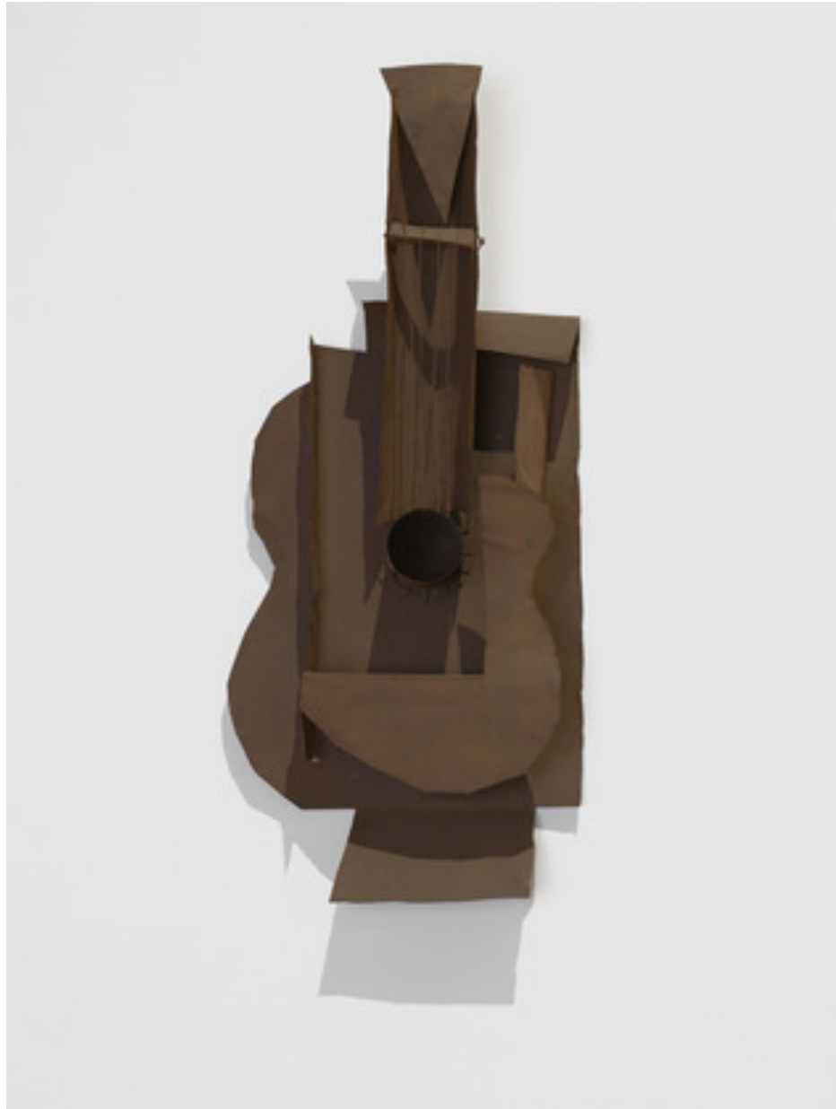
Pablo Picasso, "Guitar" (1912)